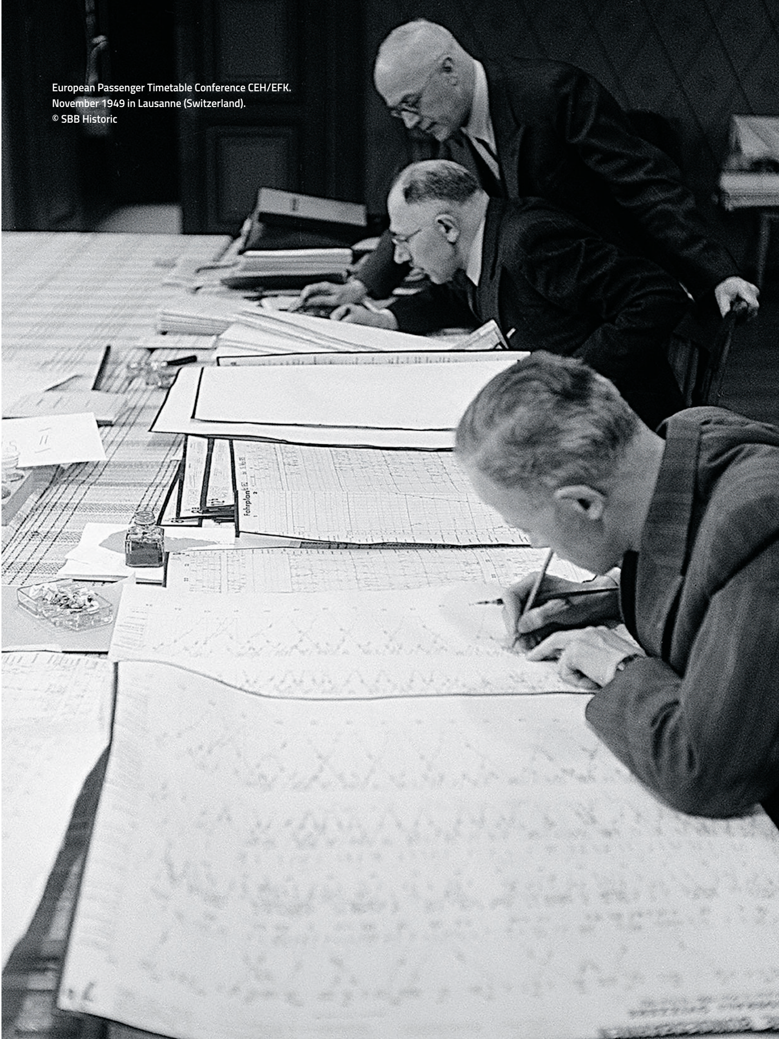
European Passenger Timetable Conference CEH/EFK. November 1949 in Lausanne (Switzerland).